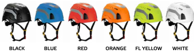
BLACK BLUE RED ORANGE FL YELLOW WHITE