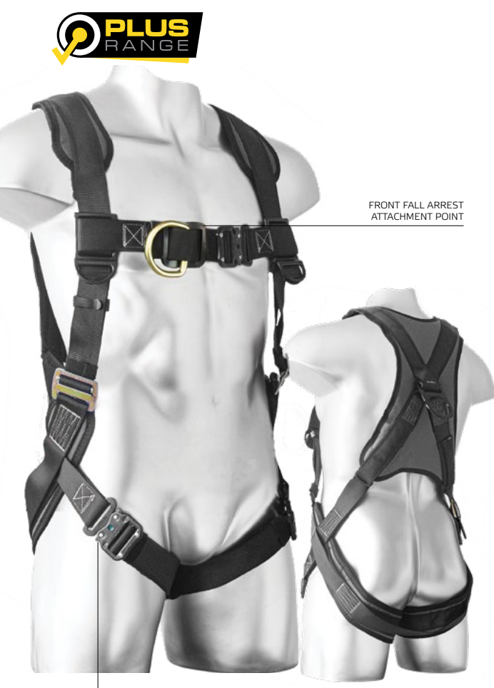
QUICK CONNECT BUCKLES