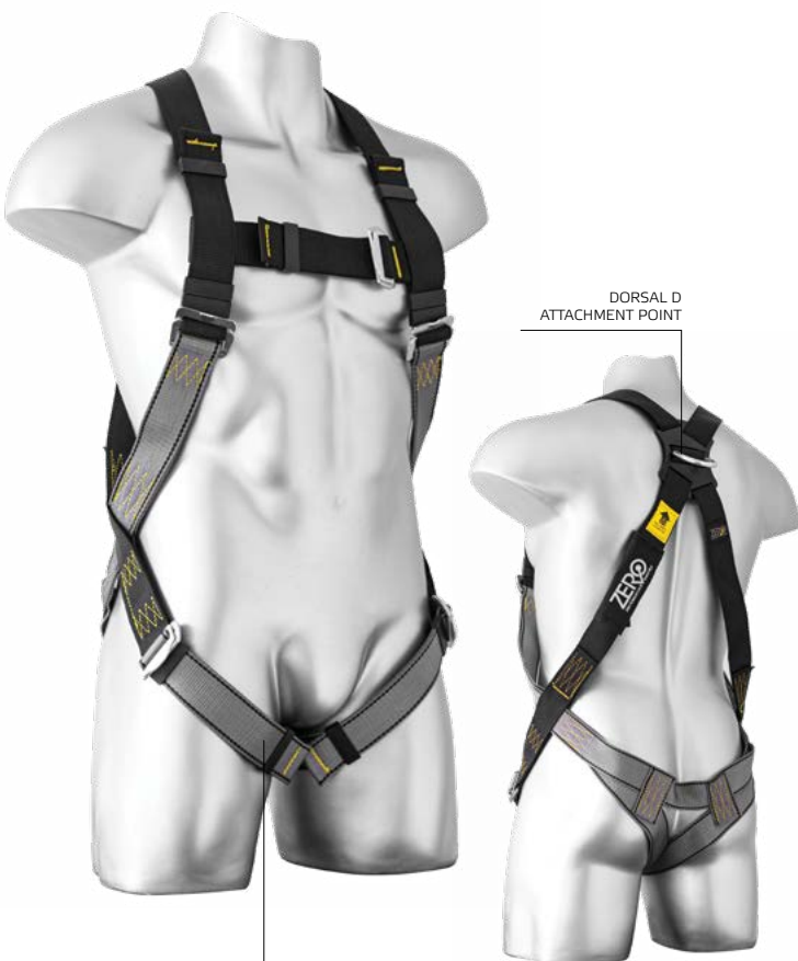
DORSAL D ATTACHMENT POINT